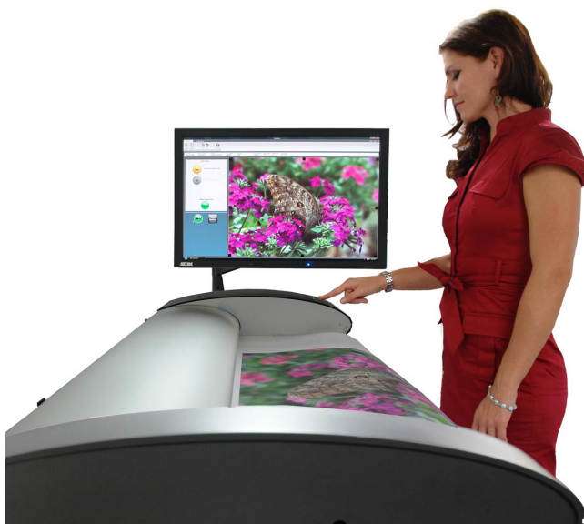
Scanned Photography in image provided by Enrol Higgins © 2009

TouchScan's ease of use allows for your scans to be done in-house without extensive training or expensive out-sourcing. TouchScan accomplishes this through its intuitive software interface which leads you through the process from start to finish. A built in customizable Wizard allows any user to start being productive within minutes. Additionally, advanced features available in an advanced mode allow you to fine tune the settings on your project through a complete image and project tool suite during any point of the scan process.