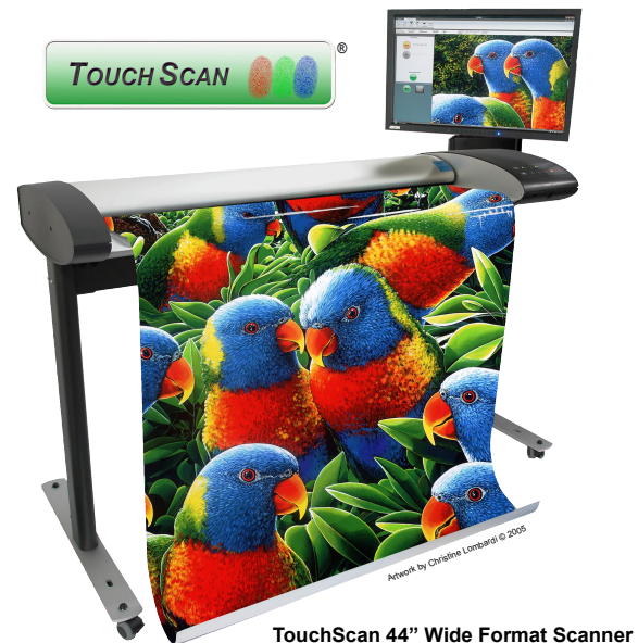
TouchScan 44" Wide Format Scanner

It's so easy to use, even the most novice user can produce professional quality scanned images in a matter of minutes. For the more experienced user, Touch Scan offers an advanced feature mode that allows users to fine tune their settings at any point during the scan process.